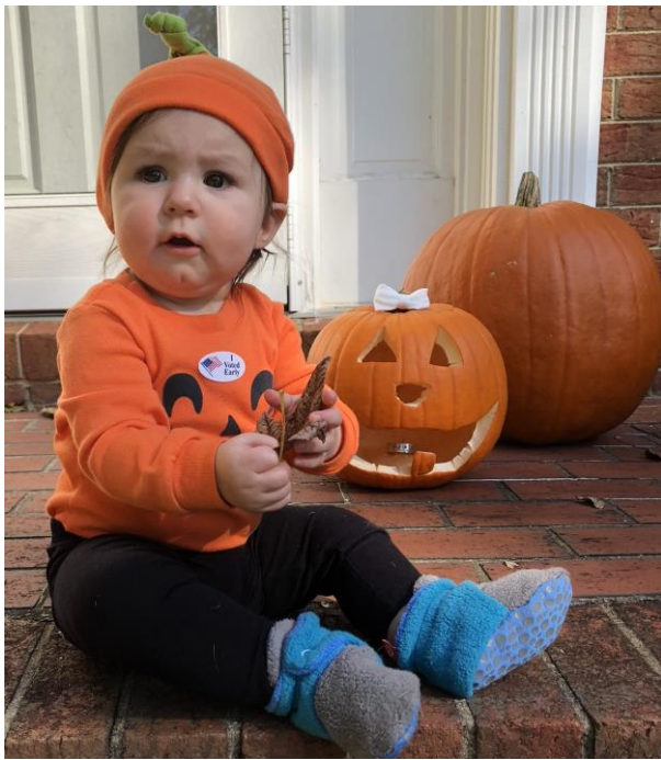
Those Eyes & Pig Tails ~ So Cute!!